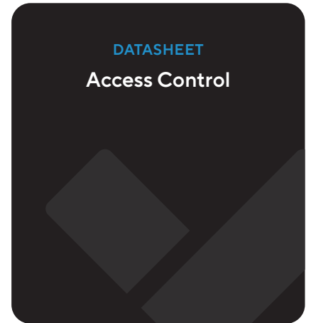
Access Control Overview